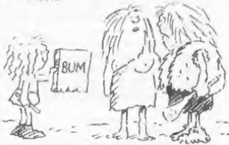
"Perhaps he's trying to communicate?"